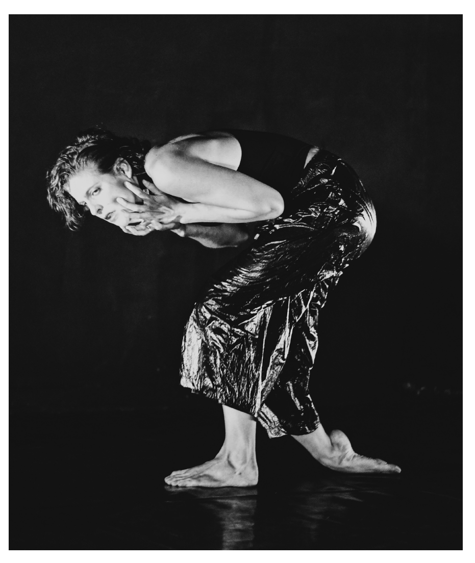
X is M00n